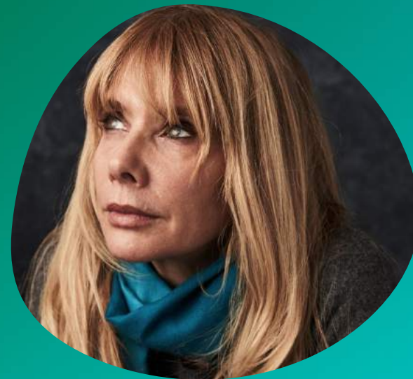
Rosanna Arquette Actor