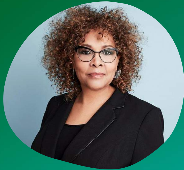
Julie Dash Director

Note that the DuSable Museum of African American History, the oldest independent African American museum in the United States and a Smithsonian Institution Affiliate is attached as the historical consultant.