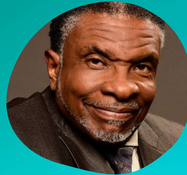
Keith David Actor